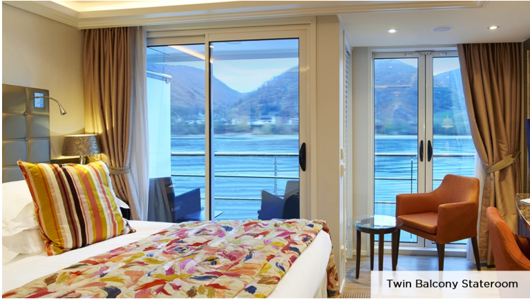
Twin Balcony Stateroom

7-night cruise | July 29-August 5, 2024 | Aboard AmaSerena