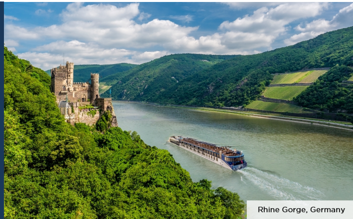
Rhine Gorge, Germany

7-night cruise from Basel to Amsterdam July 29-August 5, 2024 | AmaSerena