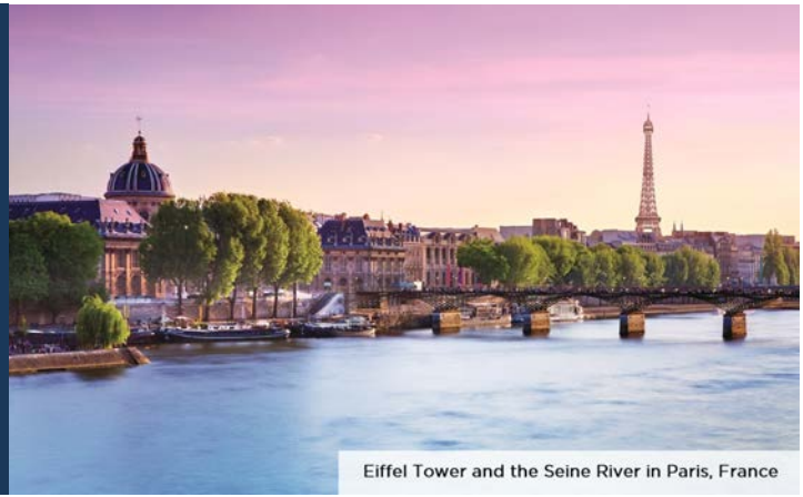
Eiffel Tower and the Seine River in Paris, France

7-night river cruise from Le Havre to Paris April 8-15, 2023 | AmaDante